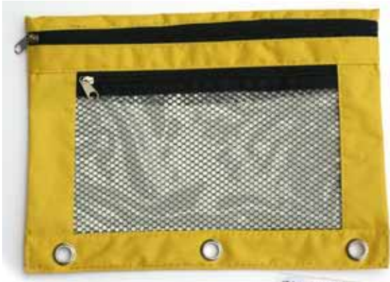
1 flat pencil case to contain everything